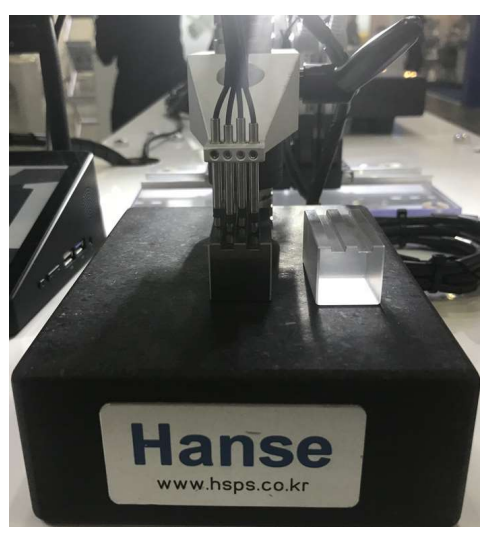
3mm probes checking different ridges.