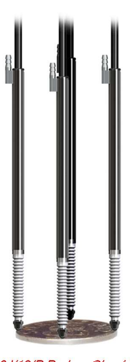
D6J/12/P Probes Checking a coin