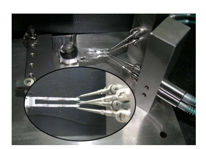
Lever Probes checking several points on an HDD component